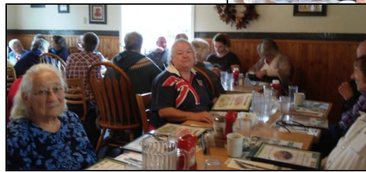
A large turnout of Spindrifters and family members enjoyed Thanksgiving at 'The Birches.'