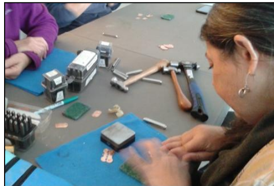
Copper pendant workshop

Each class cost $10 which included all supplies and introduced members to the myriad of classes available through the College of Craft and Design. Stay tuned for these classes to be offered again next year.