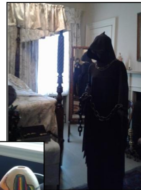
The "A Christmas Carol" room at the Museum and buoys ready for hanging on the Lobster Trap Tree.