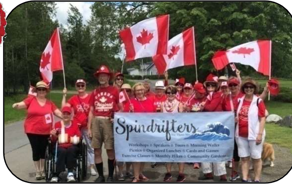
Canada Day 2019 – A enthusiastic group of Spindrifters marched in the parade!