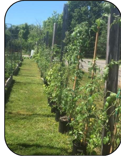
Tomato plants donated by SJDA