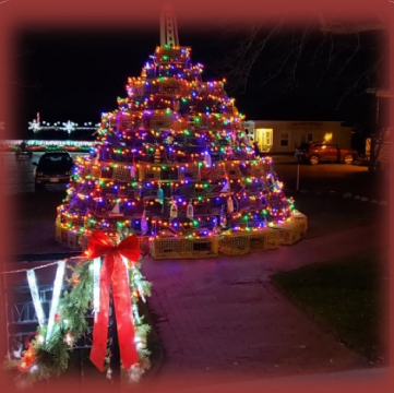
2020's Lobster Trap Tree