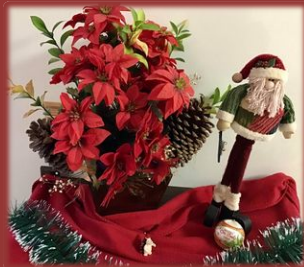
Tessa's beautiful arrangement