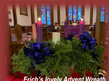
Erich's lovely Advent Wreath