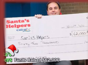
$62,000 raised for Santa's Helpers