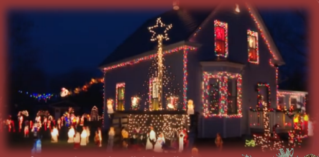
Spectacular outdoor lighting displays