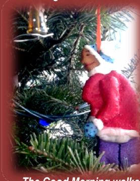
The Good Morning walkers made cookies for Honeybeans' tree