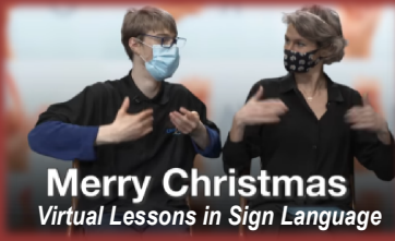
Merry Christmas Virtual Lessons in Sign Language