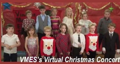
VMES's Virtual Christmas Concert