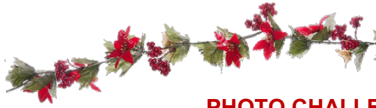
PHOTO CHALLENGE 2024 VOTING DEADLINE